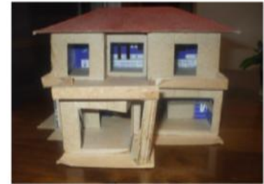
Student Model of the House