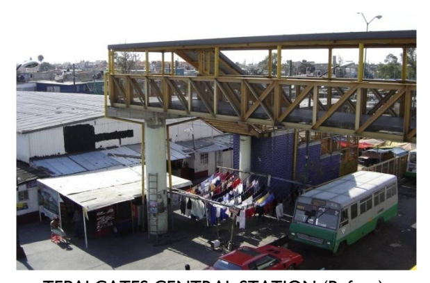
TEPALCATES CENTRAL STATION (Before)

In July 2005, the Metrobus corridor began operation on Insurgentes Avenue. It was the first BRT corridor in the city, extending over 20 kilometers (12.4 miles), with central stations. The number of passengers has rapidly increased since then from 250,000 daily in 2005 to 270,000 in 2007, an annual increase of approximately 10%. In 2008, the corridor was extended nine kilometers (about 5.5 miles) to the south, and by the end of the year, the Line 2 in the Eje 4 Sur began operating twenty kilometers (12.4 miles) from east to west. In 2009 the demand of the system grew to 480,000 daily passengers. In 2011 with the construction of the Line 3 in the Eje 1 Poniente, Metrobus increased 17 kilometers (10.5 miles), consolidating 67 km (41.6 miles), and 710,000 trips per day. Today the Metrobus system transports 187 million passengers annually. In the coming months Line 4 will be in operation with 28 kilometers (about 17 miles), and the incorporation of 46 buses with Euro V-EEV technology and 8 hybrid buses (diesel-electric), reaching the international airport and downtown Mexico City.