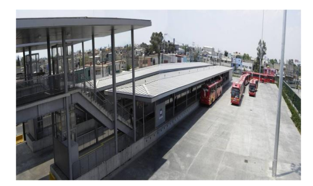
TEPALCATES CENTRAL STATION (Today)

The current Metrobus Expansion Program includes constructing ten new Metrobus lines, or 200 kilometers (124 miles) of BRT corridors and procuring 800 new buses. By 2015, there will be eight transportation corridors in Mexico City with 150 kilometers (93 miles) of restricted lanes and 600 tandem buses to replace over 2,000 microbuses. The corridors will be as follows: