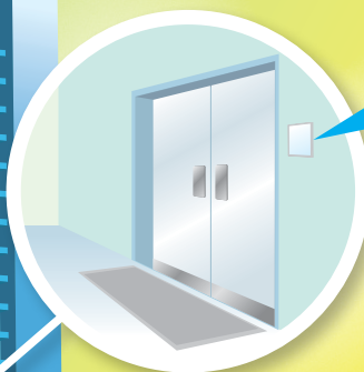
主要入口 Main Entrance