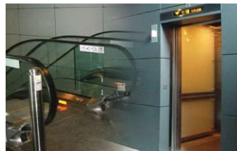
升降機及自動梯裝置 Lift and escalator installation