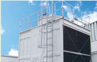
空調裝置 Air-conditioning installation

Through mandatory implementation of the Building Energy Code, the BEEO regulates energy efficiency standards of key building services installations of prescribed buildings (except units of industrial and residential buildings). Those installations include air-conditioning installation, electrical installation, lighting installation as well as lift and escalator installation.