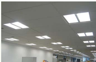
照明裝置 Lighting installation