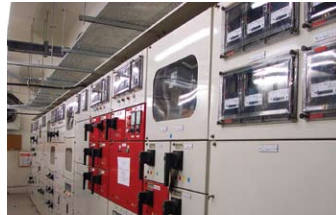
電力裝置 Electrical installation